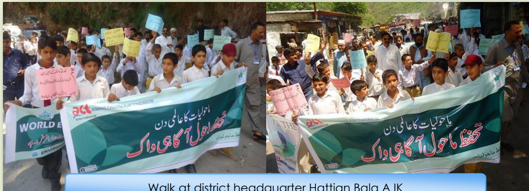
Walk at district headquarter Hattian Bala AJK

In district Neelum and district Haitian Bala ACT collaborated with AJKRSP and Press for Peace to organize awareness raising walks. At each district headquarter district administration, officials of local government, department of health, education, journalists, lawyers and representatives from trade unions proactively participated in the events.