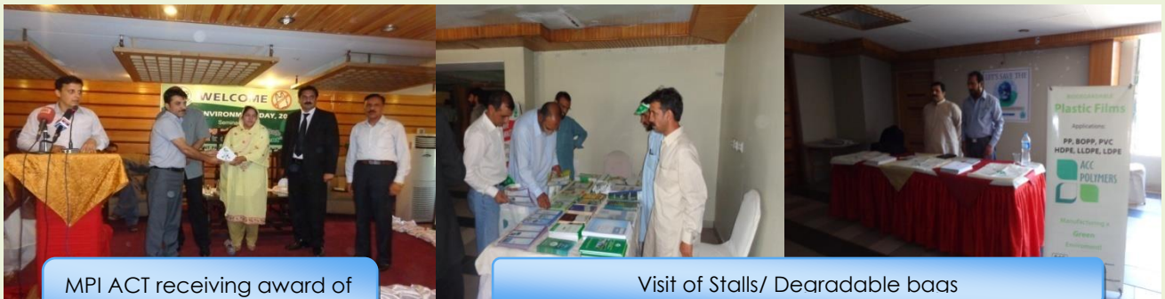
MPI ACT receiving award of environment protector

At the end of symposium participants visited stalls carrying alternate degradable material for utilization instead of plastic bags and reading material related to environment protection.