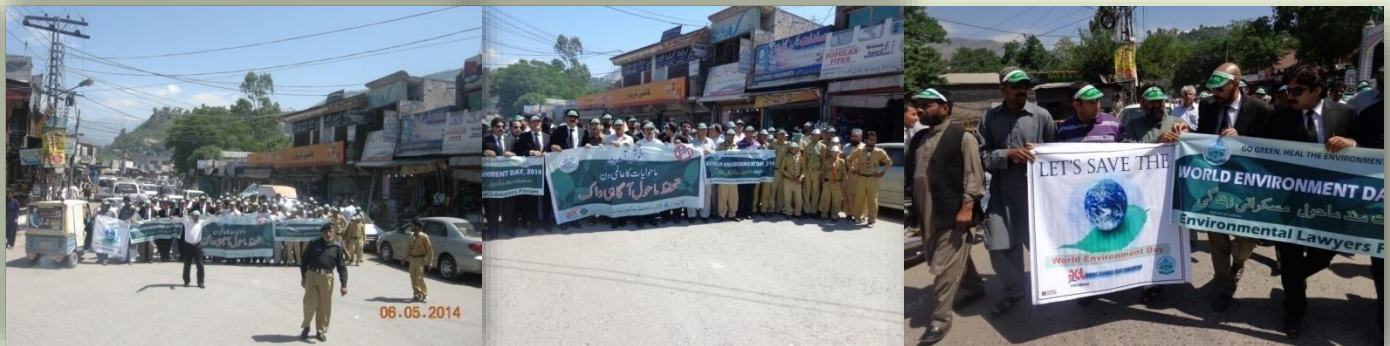
Walk at Capital City of Muzaffarabad AJK

Walk started from central press club and culminated at Domail Muzaffarabad.