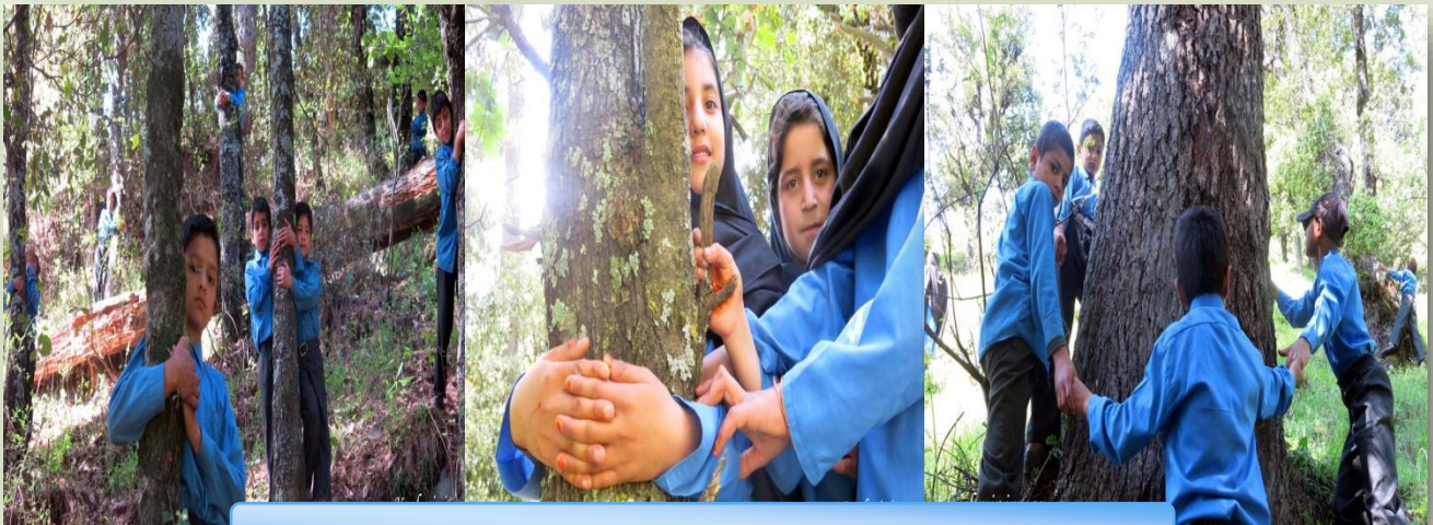
Tree Huas Event by Children of PFP School Neelum AJK

In collaboration with AJKRSP, awareness raising walk was organized at district headquarter of Neelum. More than 170 people from all trades of life participated in the vent. Awarness raisin material was distributed to households and shops by the participants of walk. The most innovative event was organized in collaboration with Press for Peace where more than 100 children of schools performed an activity of Tree Hugs showing their deep love and regard for their environment and sensitizing general public to protect environment and abandon tree cutting.